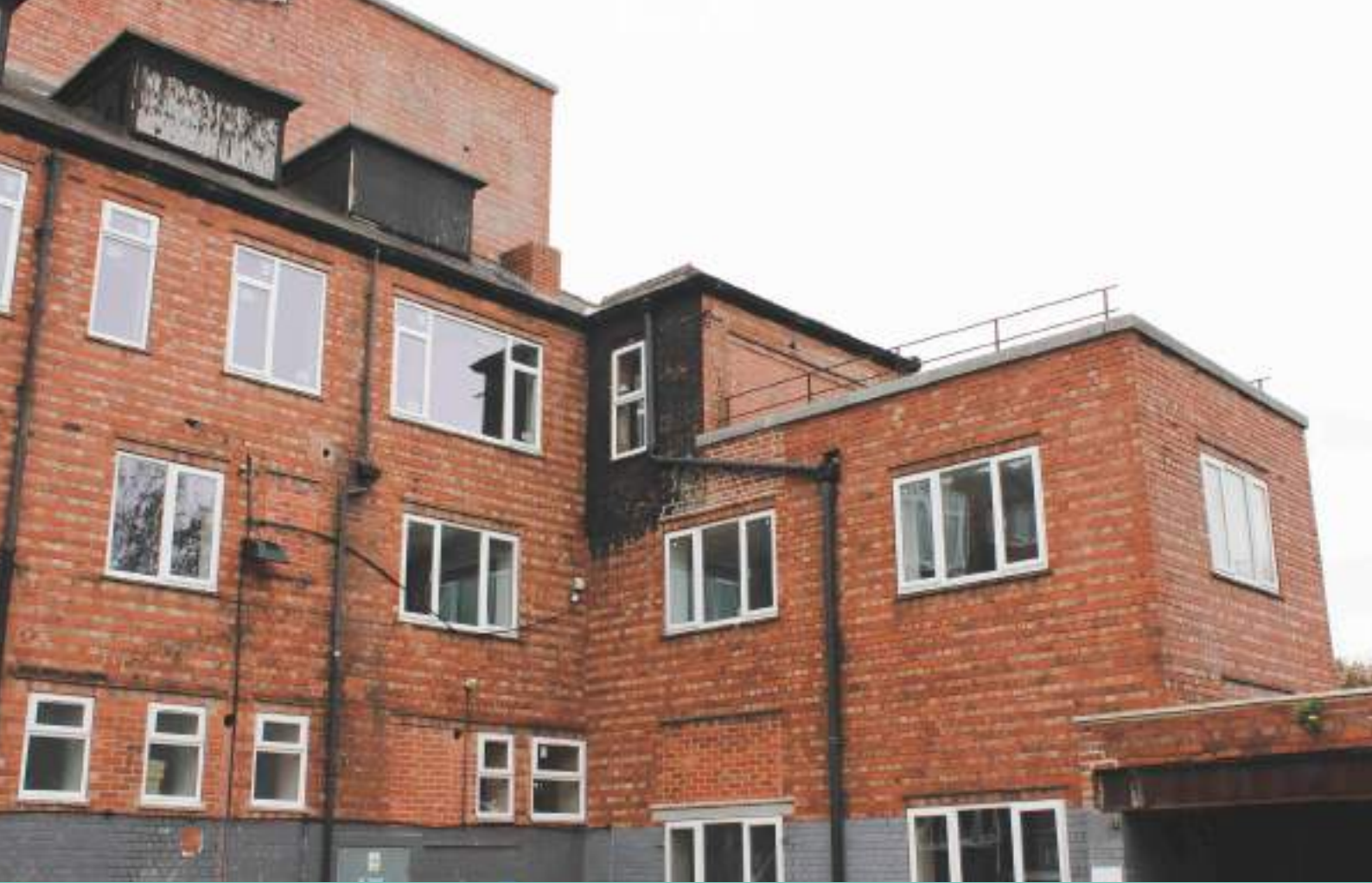
MANSFIELD CAMPUS RENOVATIONS 2018/19